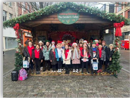
Our Amazing LPS Choir Performing @Town Centre

On behalf of everyone at LPS, I would like to thank our families and community for their unrivalled support. I would like to thank our outstanding team for their resilience, courage and passion to support our wonderful community, our learners are very lucky to have such caring, professional and innovative staff.