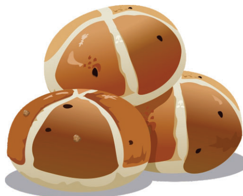
hot cross buns

Copyright ©2020 Speech Link Multimedia Ltd